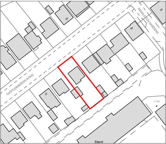
Existing Location Plan Scale 1:1250